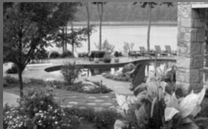
The Syfan Residence