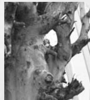
The lasting results of crepe "murder."

Whether your crepe myrtles are shaped into tree forms with gentle cascades of branches or left to grow as shrubs, proper pruning is essential. Don't be caught committing "crepe murder." Our expert crews know just the right way to preserve your plants, maximize blooms and improve fall color.