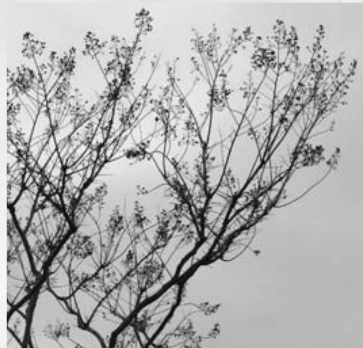
Crepe myrtles do better with minimal pruning.